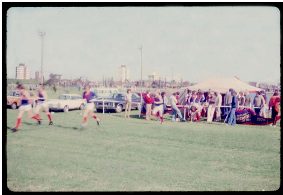
St Bede's players take the field for the start of the grand final. Note the 1968 and 1970 premiership flags on display, and the tent pitched by the club.