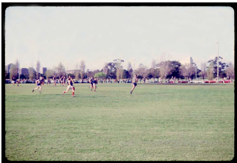
Action from the grand final.