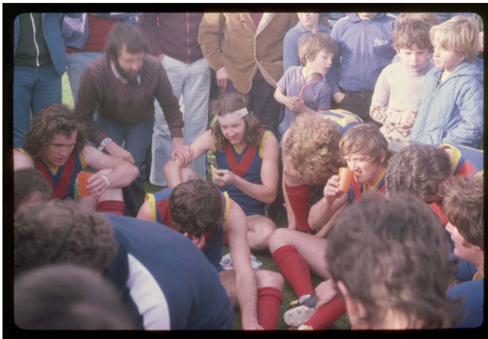
Interested onlookers at the three quarter time huddle of the second semi final.