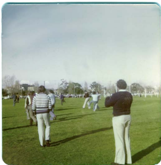
Jubilant supporters invade the ground to embrace the players after the grand final victory.