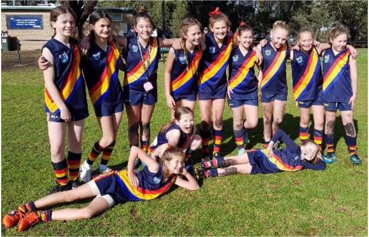
Under 12 Girls 2017