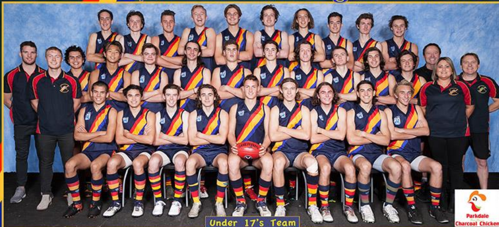
Under 17's Team