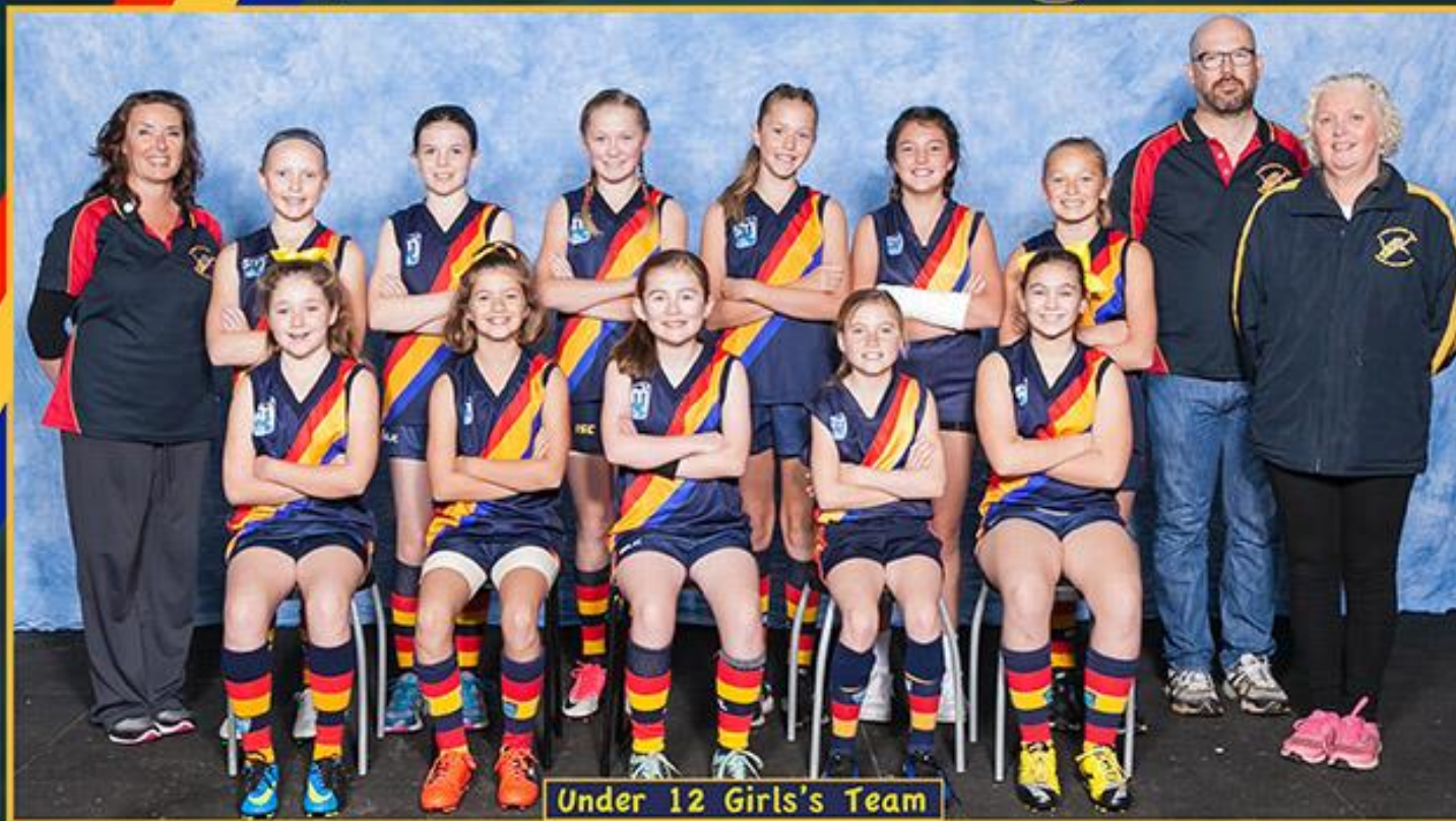
Under 12 Girls' Team