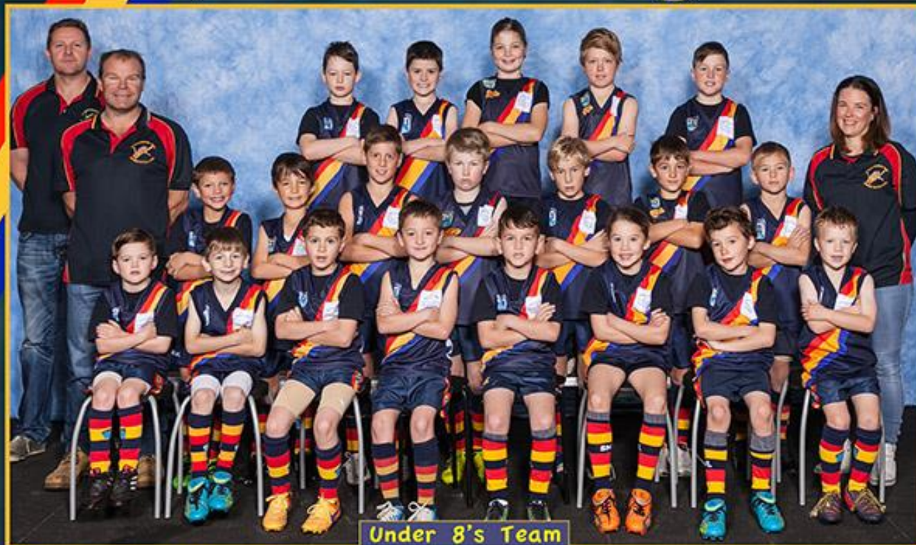
Under 8's Team