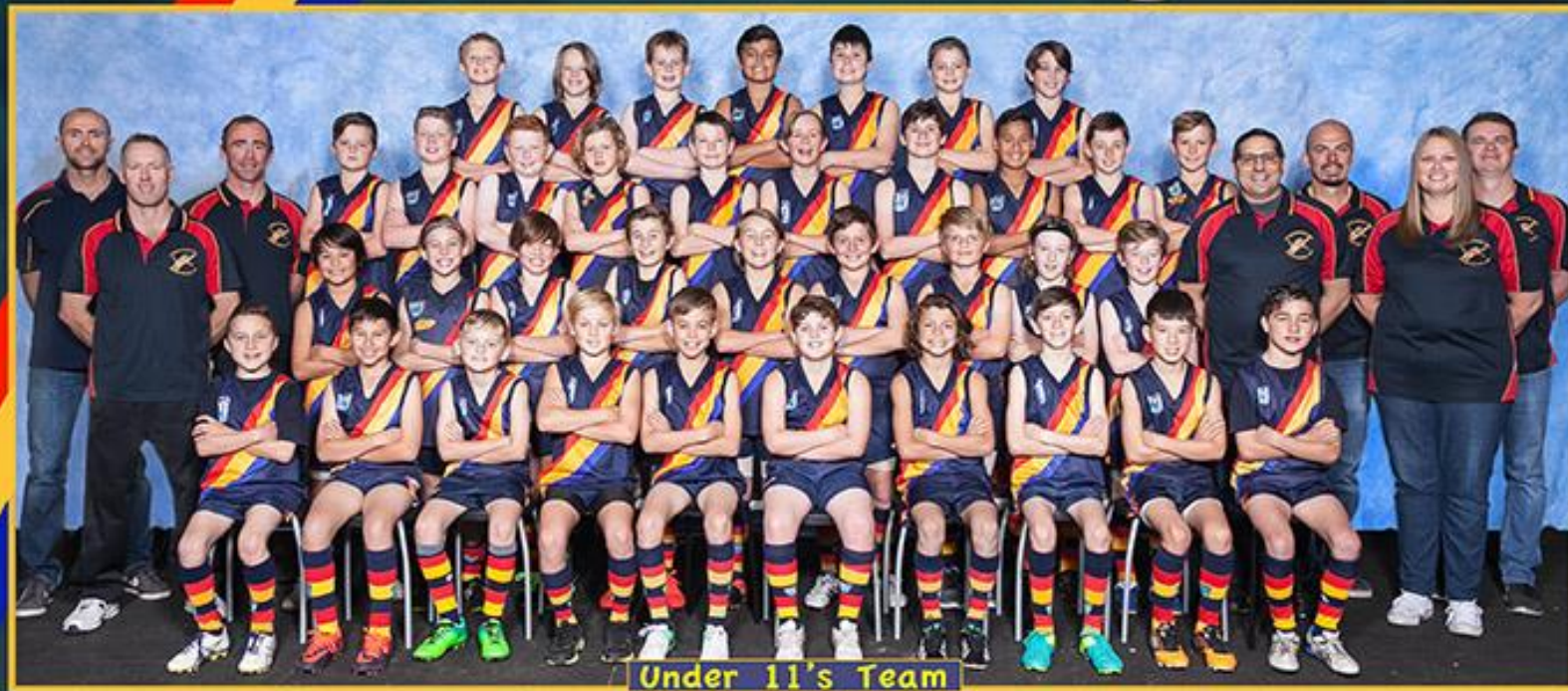
Under 11's Team