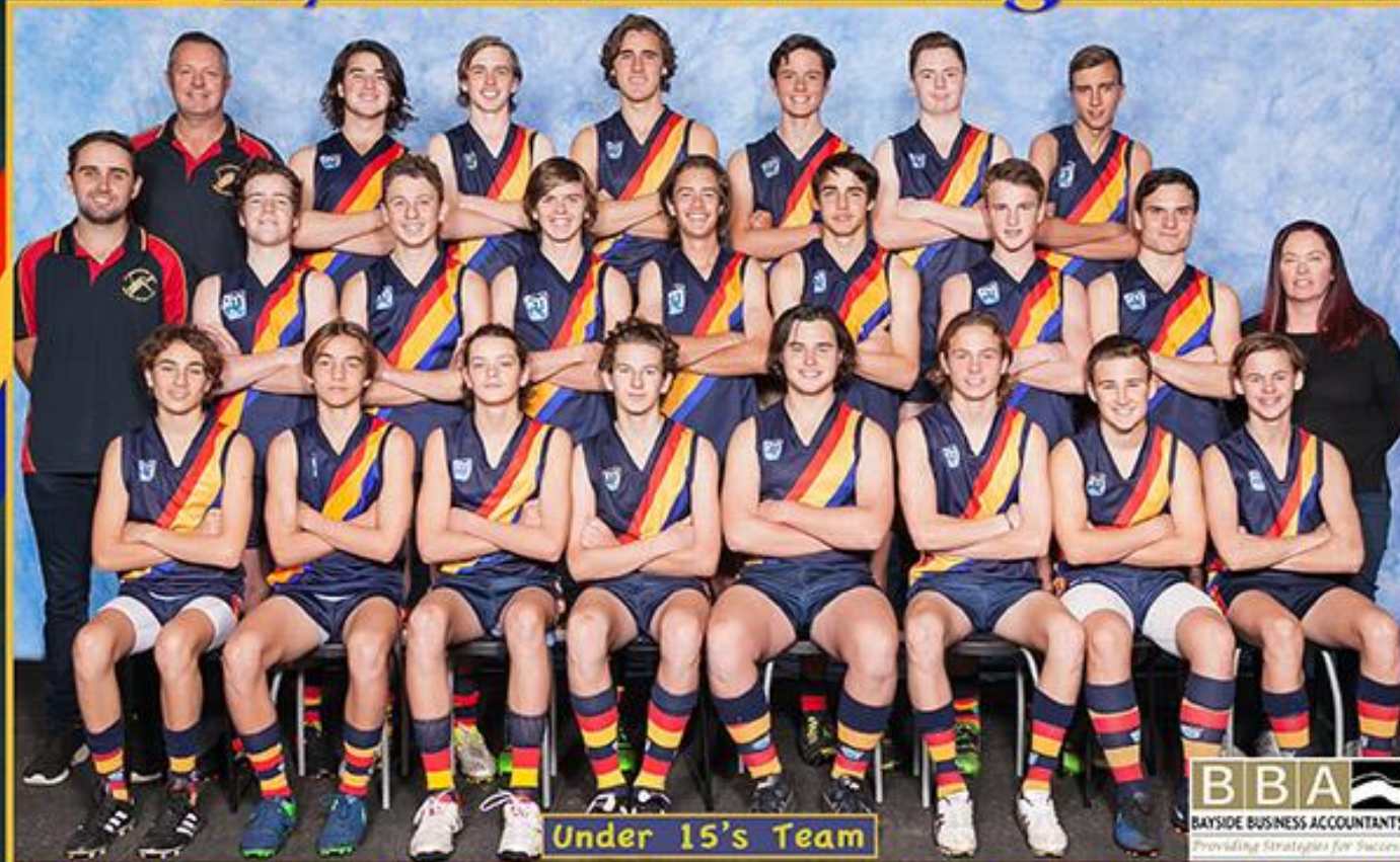
Under 15's Team