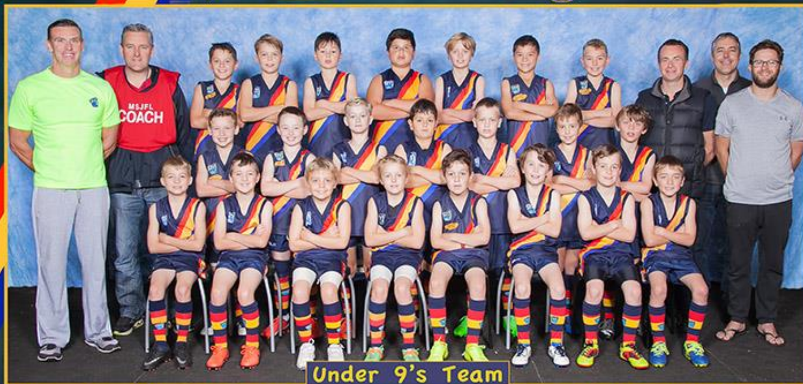
Under 9's Team