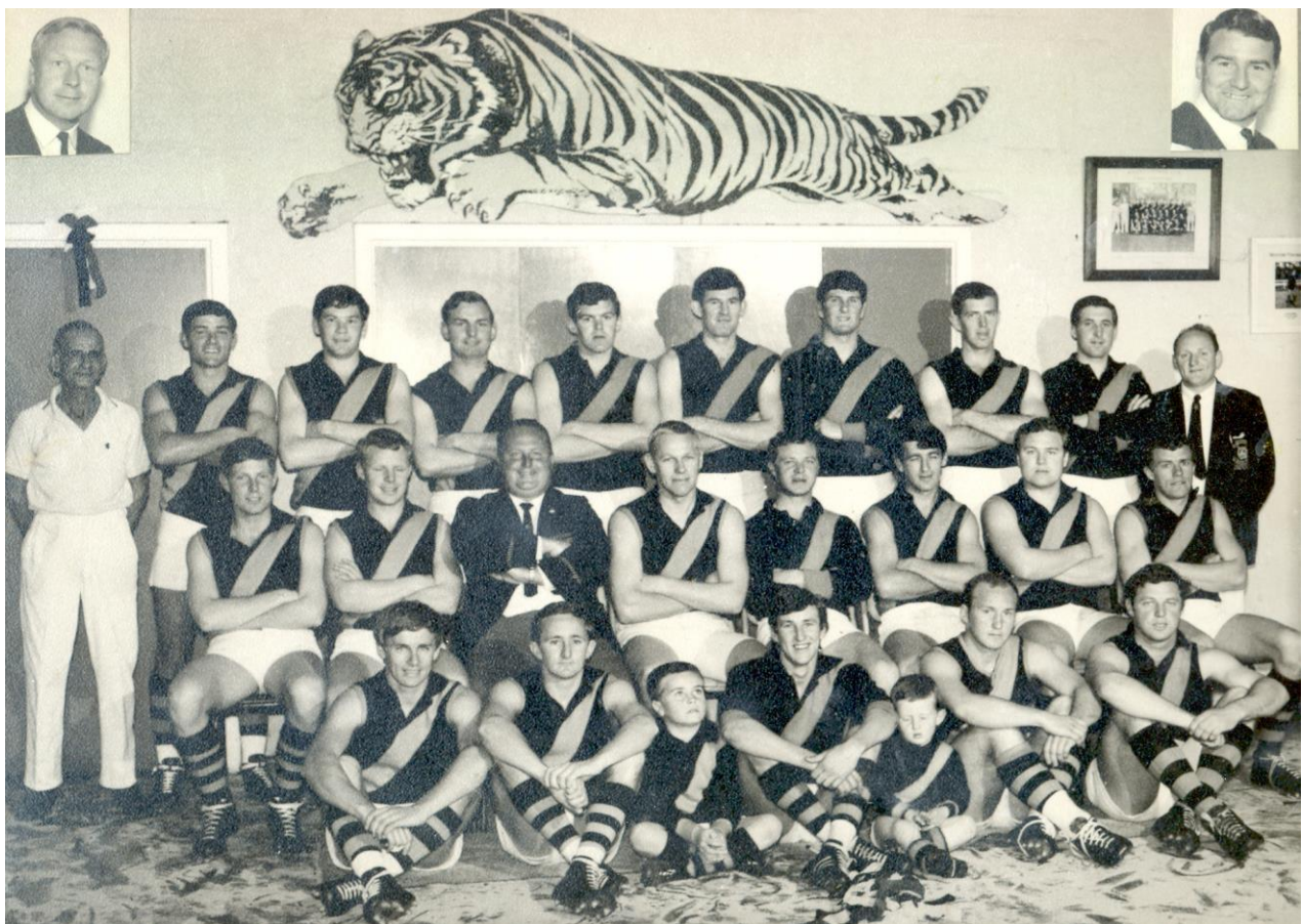
Mentone FC Premiers 1967