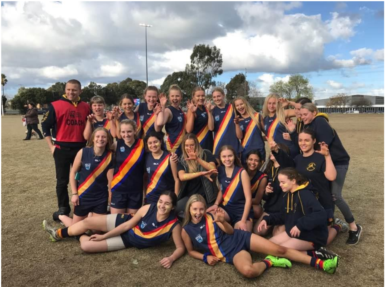
Under 16 Girls 2017

Work on a well-defined rotation system to rest players more regularly throughout matches and avoid the onset of fatigue late in quarters and matches.