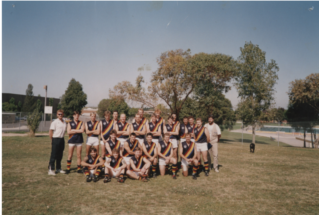
St Bede's/Mentone Tigers Reserves team, Round 1, versus Thomastown, 1993.