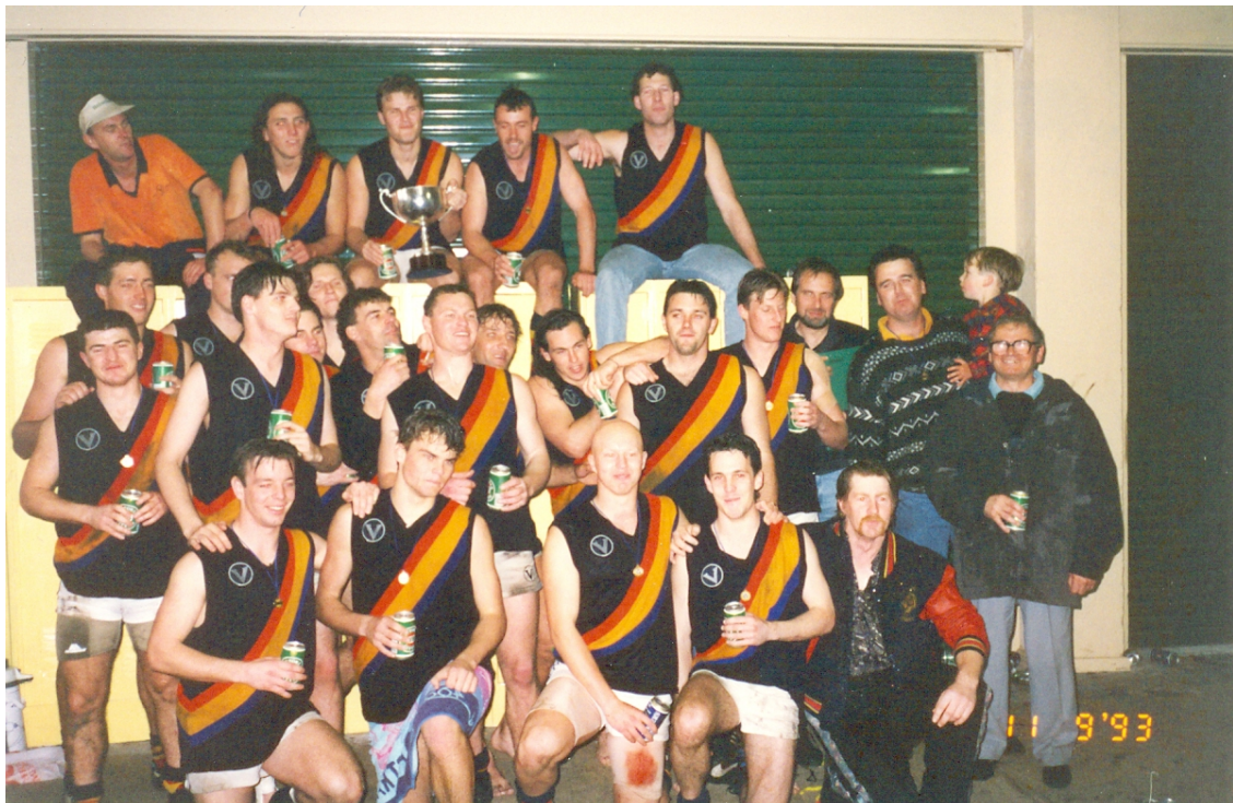
In the change-rooms after the Grand Final, St Bede's/Mentone Tigers AFC versus Old Geelong, 11 September 1993.